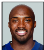
WR Derrick Mason