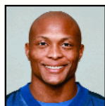
RB Eddie George