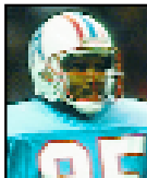
WR Drew Hill