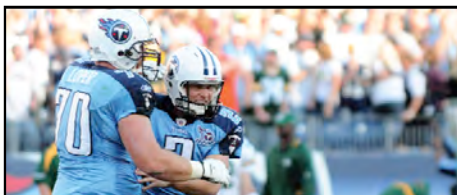
Rob Bironas celebrates after his 41-yard field goal lifted the Titans to a 19-16 victory over the Green Bay Packers last season at LP Field.