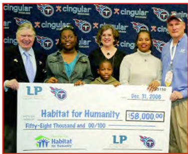
Adams annually teams with LP Building Products to sponsor a Habitat for Humanity home for a Nashville family.

Adams donated Super Bowl tickets to the Nashville Red Cross during a time when their available blood supply was at a critically low stage. Blood donors were eligible to win two Super Bowl tickets, and the "Super Bowl Blood Drive" resulted in