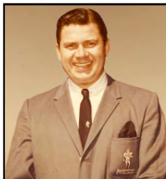
Titans owner K.S. “Bud” Adams, Jr. was the co-founder of the American Football League in 1959.

The NFL will celebrate the 50th anniversary of the AFL in 2009 with a logo and uniform patch. Additionally, the original AFL clubs will wear special throw-back uniforms for select games. The Titans play five games against former AFL opponents (Bills, Chargers, Dolphins, Patriots and Jets).