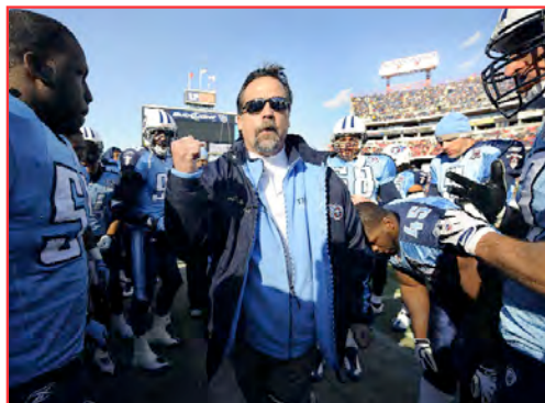
Fisher rallied the Titans to a franchise-record 10-0 start en route to his second AFC South championship in 2008.

(Buffalo Bills, 1990-91) and Mike Holmgren (Green Bay Packers, 1996-97). The defense reached a new level of success in 2000, earning the number one ranking in the NFL for yards allowed and surrendering