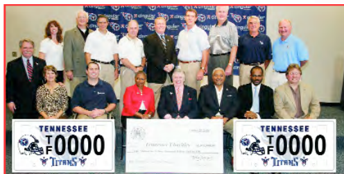
Nearly $2 million has been raised for statewide charities through the Titans License Plate program.