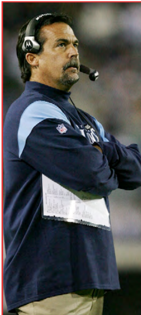
Fisher owns the franchise record for most wins by a head coach with 133 victories.

In 2005, with a win over the Houston Texans (10/9/05), he became just the 17th coach to reach the 100-win mark with one team.