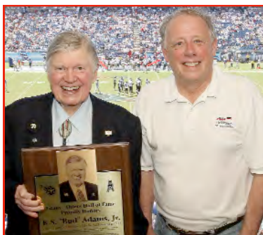
Tennessee Governor Phil Bredesen (right) was present last season when Adams was inducted into the franchise's ring of honor.

Annual American General Dinner of Champions in February 2001; was honored by the Cherokee National Historical Society at a dinner at the Gilcrease Museum in Tulsa, Okla., in September 2000; was honored at Tennessee State University in August 2000; was the recipient of the Lamar Hunt Outstanding Pro Football Executive Award for the year