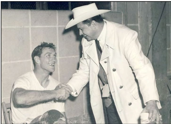
Adams lured LSU running back Billy Cannon, who played a key role in the Oilers capturing the first two American Football League Championships.