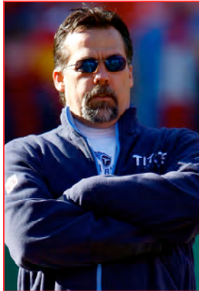
Entering his 15th full season, Jeff Fisher is currently the NFL's longest-tenured head coach.

Hallmarks of a Fisher-led team include a stout rushing defense, the ability to possess the ball with a strong running game and poise in the midst of adversity. His ability