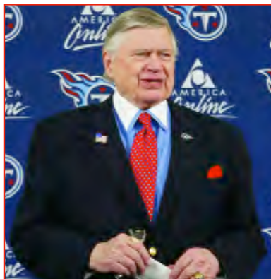
Adams celebrates his 50th season as Founder, Owner, Chairman of the Board, President and CEO of the Titans/Oilers franchise.

President and CEO of the Titans/Oilers franchise, K.S. "Bud" Adams, Jr. is an enduring figure in the NFL. As one of the original team owners in the American Football League, he has guided his franchise to new heights since relocating to Nashville in 1997, posting six playoff appearances, including an AFC Championship (1999), AFC Central title (2000), two AFC South titles (2002 & 2008), AFC Championship appearance (2002) and Wild Card teams in 2003 and 2007. He is one of only four current NFL owners to reach the 350-win plateau – Adams, Ralph Wilson (Buffalo), Dan Rooney (Pittsburgh) and Al Davis (Oakland/Los Angeles). Consistently fielding winning teams, the franchise has earned 21 playoff appearances in 49 seasons, a total that ranks fifth among NFL teams since 1960.