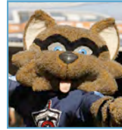
T-Rac Titans Mascot